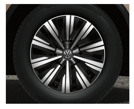
STANDARD ON ELEGANCE PHEV 19" 'Tirano' alloy wheels 8J x 19 Tyres: 255/55 R19