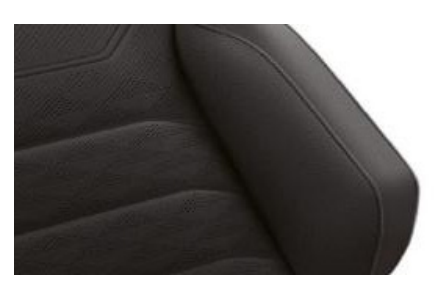
"Savona" leather Soul (VM) Optional on Elegance & Elegance PHEV