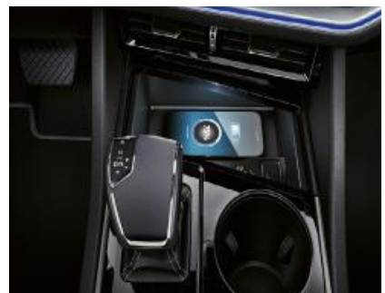
The above specifications are for information purposes only as our products are continually updated and changes may be made to the specifications at any time. If you require any specific feature, you must consult your local dealer who is regularly updated with any change in specification. Specifications are subject to change without notice.