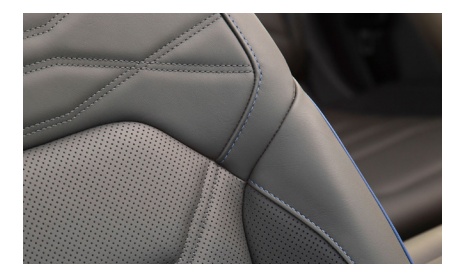
"Puglia" leather Soul (OF) Standard on R Model