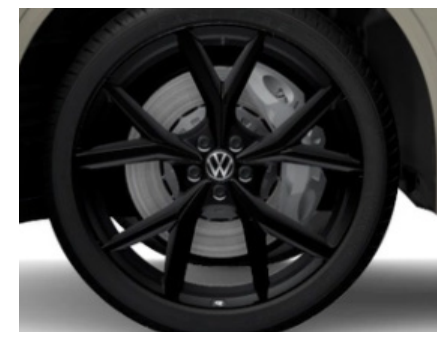
OPTIONAL ON 'R' 22" 'Estoril' alloy wheels in black 9.5J x 22 Tyres: 285/35 R22

The addition of optional extras may result in the vehicle increasing in Co2 g/km and therefore, attracting a higher rate of VRT than described in this product guide. For your exact configuration value, both Co2 g/km and RRP, please visit volkswagen.ie configurator.