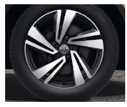
OPTIONAL ON TOUAREG & ELEGANCE 20" 'Nevada' alloy wheels, in 'Black' with diamond turned surface 9J x 20 Tyres: 285/45 R20 Note: Not available on Elegance PHEV