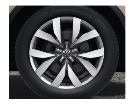
STANDARD ON ELEGANCE 20" 'Montero' alloy wheels in 'Glam SIlver' 9J x 20 Tyres: 285/45 R20