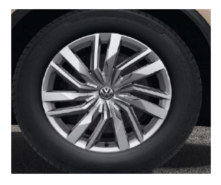
OPTIONAL ON TOUAREG 19" 'Osorno' alloy wheels 8J x 19 Tyres: 255/55 R19