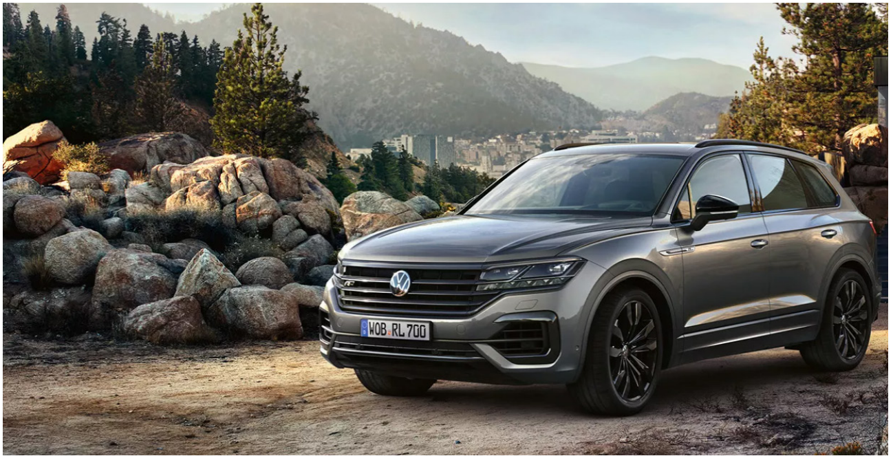
Note: The above image shows optional 21" 'Suzuka' alloy wheels in black

For exact options prices for your vehicle, please contact your local dealer or visit www.volkswagen.ie