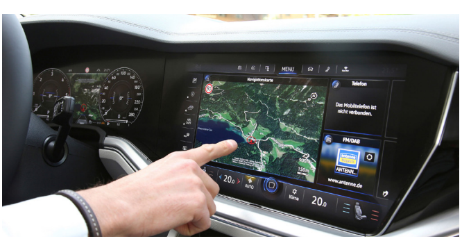
The above specifications are for information purposes only as our products are continually updated and changes may be made to the specifications at any time. If you require any specific feature, you must consult your local dealer who is regularly updated with any change in specification. Specifications are subject to change without notice.