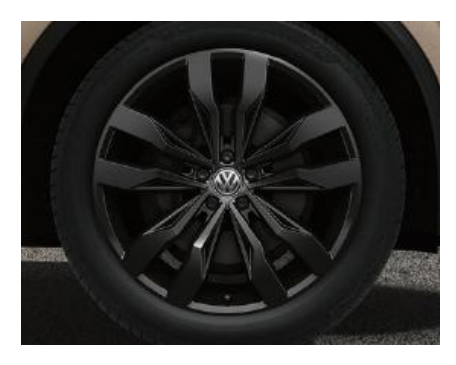
OPTIONAL ON R-LINE & 'R' 21" 'Suzuka' alloy wheels in black 9.5J x 21 Tyres: 285/40 R21