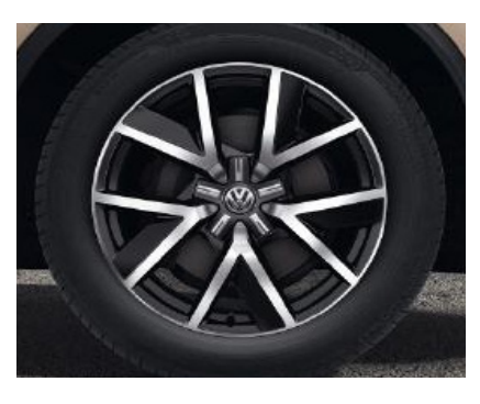
STANDARD ON R-LINE & R 20" 'Braga' alloy wheels, in 'Black' with diamond turned surface 9J x 20 Tyres: 285/45 R20