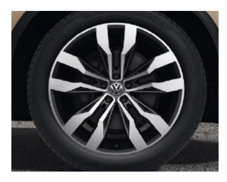
OPTIONAL ON R-LINE 21" 'Suzuka' alloy wheels 9.5J x 21 Tyres: 285/40 R21