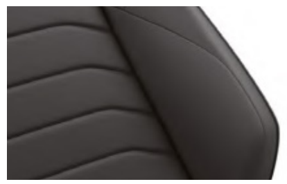
"Vienna" leather Soul (VM) Standard on Touareg, Elegance & Elegance PHEV