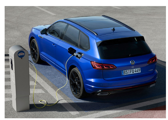
Note: The above images show optional 22" 'Estoril' alloy wheels in black, exclusive to R

The above specifications are for information purposes only as our products are continually updated and changes may be made to the specifications at any time. If you require any specific feature, you must consult your local dealer who is regularly updated with any change in specification. Specifications are subject to change without notice.