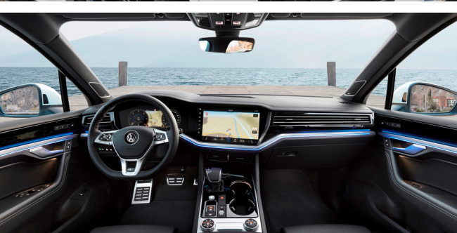
The above specifications are for information purposes only as our products are continually updated and changes may be made to the specifications at any time. If you require any specific feature, you must consult your local dealer who is regularly updated with any change in specification. Specifications are subject to change without notice.