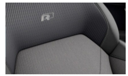
"Savona" leather Soul (ID) Standard on R-Line