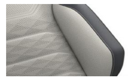
"Savona" leather Mistral/ Grigio (VM) Optional on Elegance & Elegance PHEV