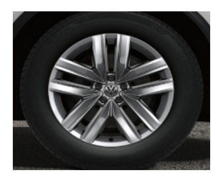
STANDARD ON TOUAREG 19" 'Esperence' alloy wheels 8J x 19 Tyres: 255/55 R19

The addition of optional extras may result in the vehicle increasing in Co2 g/km and therefore, attracting a higher rate of VRT than described in this product guide. For your exact configuration value, both Co2 g/km and RRP, please visit volkswagen.ie configurator.